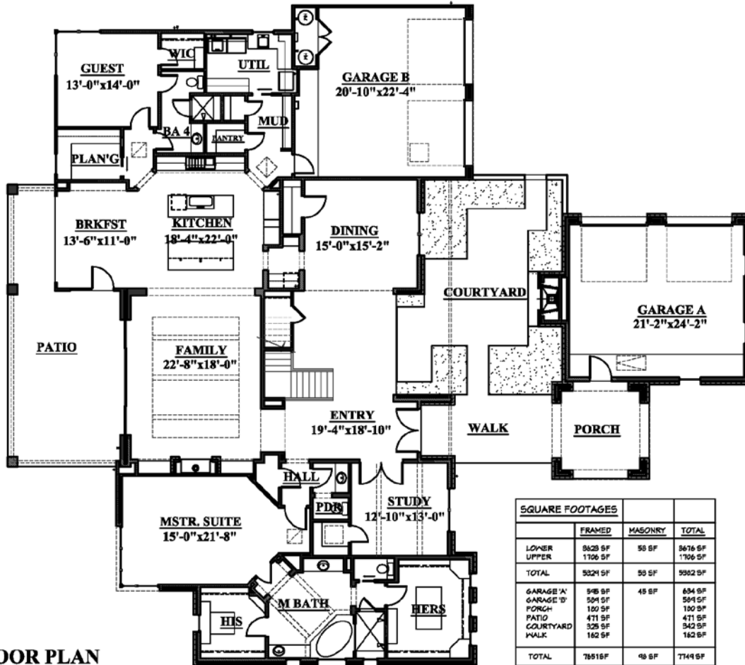
FLOOR PLAN 13012 © 2015 EPPRIGHT HOMES L.L.C.